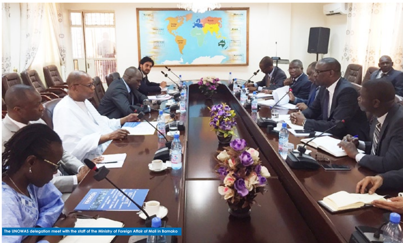
The UNOWAS delegation meet with the staff of the Ministry of Foreign Affairs of Mali in Bamako

For his first visit to the G5 Sahel countries (Burkina, Niger, Mali, Mauritania and Chad) since the establishment of UNOWAS in January, the Special Representative of the UN Secretary-General in West Africa and the Sahel (UNOWAS), Mr Mohamed Ibn Chambas, called for a stronger partnership between the countries of G5 Sahel and the United Nations.