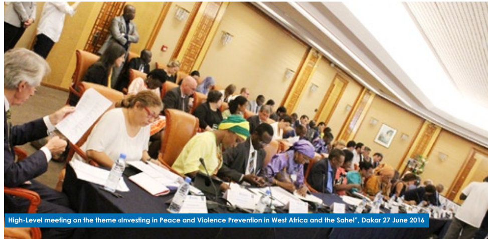
High-Level meeting on the theme «Investing in Peace and Violence Prevention in West Africa and the Sahel», Dakar 27 June 2016

A high-level meeting on the theme: «Investing in Peace and Violence Prevention in West Africa and the Sahel» was held in Dakar on 27 and 28 June 2016 to identify effective measures to prevent violence including violent extremism and to explore innovative approaches to invest more in peace... Read More P.3