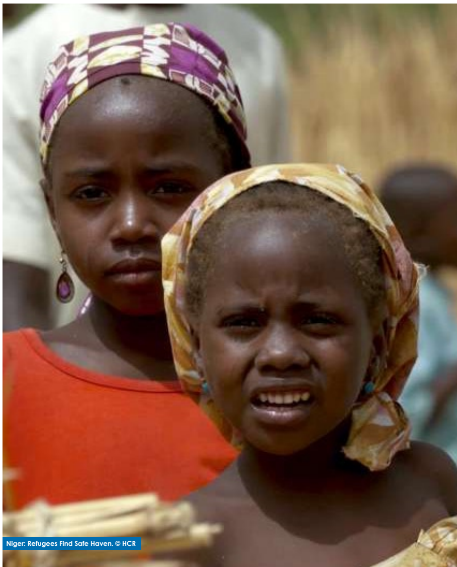
Niger: Refugees Find Safe Haven.

don't know how I am still alive. I was completely overwhelmed by what was happening around me. There were dead bodies of men, women, children around me. I spent the night without eating, without drinking. The insurgents who had remained by the river were finishing the survivors."