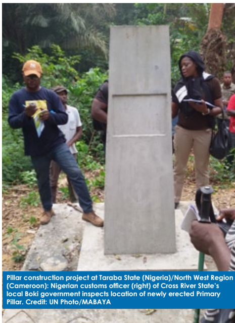
Pillar construction project at Taraba State (Nigeria)/North West Region (Cameroon): Nigerian customs officer (right) of Cross River State's local Boki government inspects location of newly erected Primary Pillar.

Under the leadership of the Chair of the Cameroon-Nigeria Mixed Commission (CNMC), Mr Mohamed Ibn Chambas, the two delegations met in Yaoundé, Cameroon on 6 June to discuss outstanding issues and decide on a roadmap to ensure a peaceful and final settlement of the demarcation of the land border between the two neighbors.