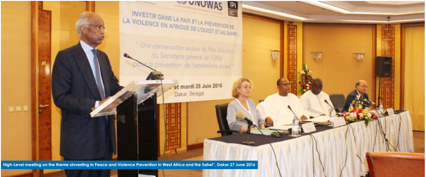
High-Level meeting on the theme «Investing in Peace and Violence Prevention in West Africa and the Sahel», Dakar 27 June 2016

A high-level meeting on the theme: «Investing in Peace and Violence Prevention in West Africa and the Sahel» was held in Dakar on 27 and 28 June 2016 to identify effective measures to prevent violence, including violent extremism and to explore innovative approaches to invest more in peace in West Africa and the Sahel.