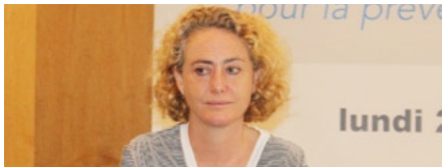
Dagmar Schmidt, Amb. Switzerland to Senegal

«Prevention requires that we work on the causes of violence, not just the symptoms. This often involves a paradigm and attitude shift – and more specifically it involves a willingness to accept plural societies and diverse identities, and to recognize the value of tolerance and dialogue.»