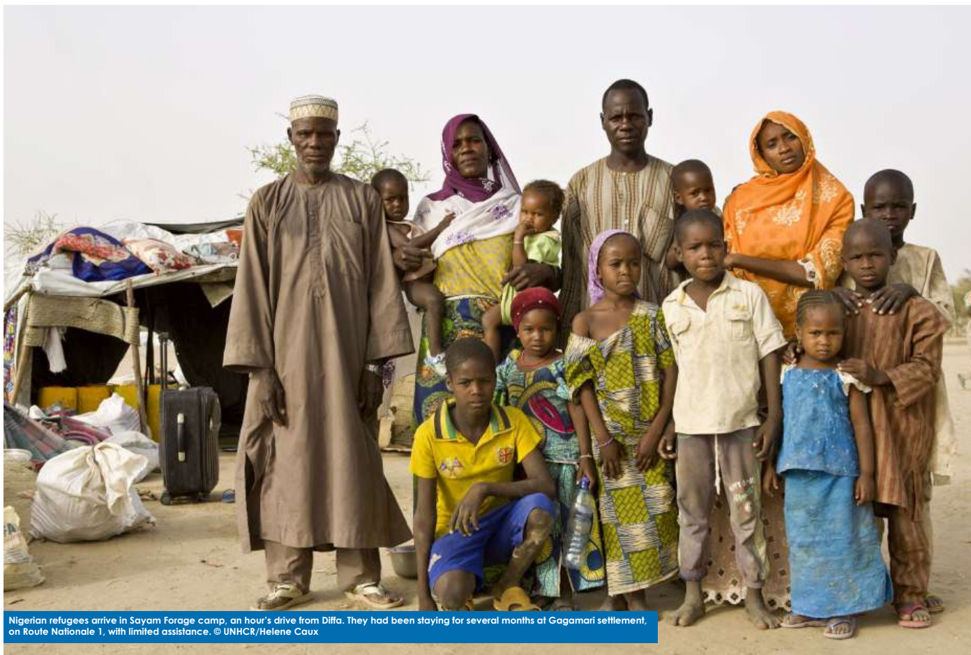
Nigerian refugees arrive in Sayam Forage camp, an hour's drive from Diffa. They had been staying for several months at Gagamari settlement, on Route Nationale 1, with limited assistance.

they stopped, exhausted, at a settlement called Gagamari, close to the town of Diffa.