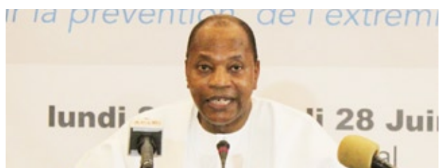
Mohamed Ibn Chambas: SRSB UNOWAS

«Over the past decade, efforts to prevent violent extremism were primarily designed as a complement to anti-terrorist operations. They often mainly resulted in short-term security measures aimed at containing the immediate consequences of violent acts and preventing their recurrence.»