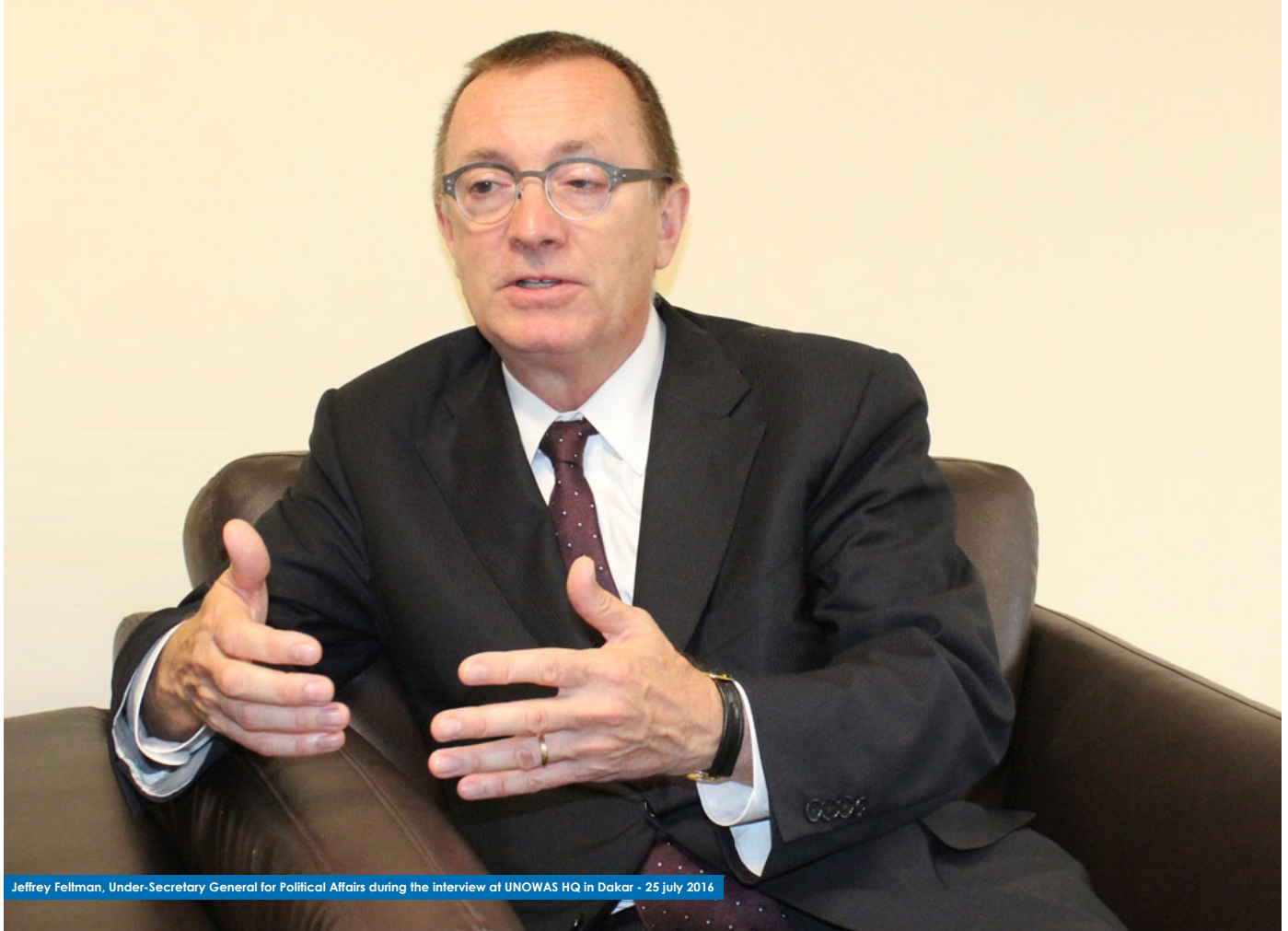
Jeffrey Feltman, Under-Secretary General for Political Affairs during the interview at UNOWAS HQ in Dakar - 25 July 2016

At the conclusion of his tour in Central and West Africa regions on 25 July, Mr. Jeffery Feltman, United Nations’ Under-Secretary-General for Political Affairs spoke to UNOWAS E-Magazine in Dakar about the objectives of his visit and the role of UNOWAS in the region. Interview.