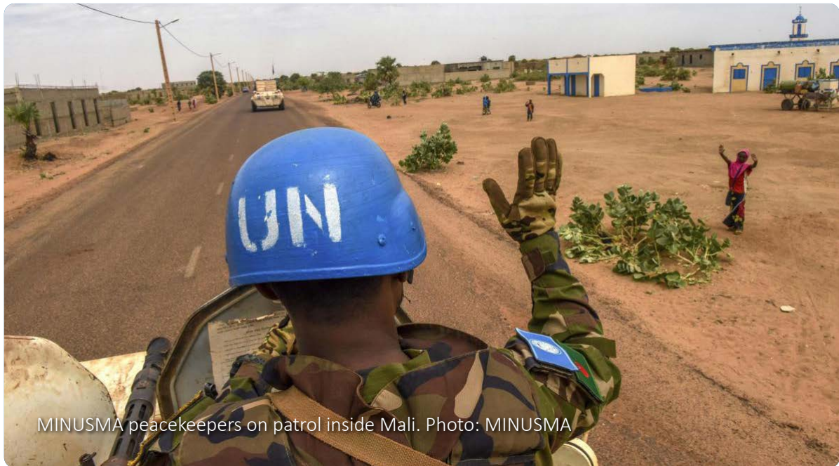
MINUSMA peacekeepers on patrol inside Mali.