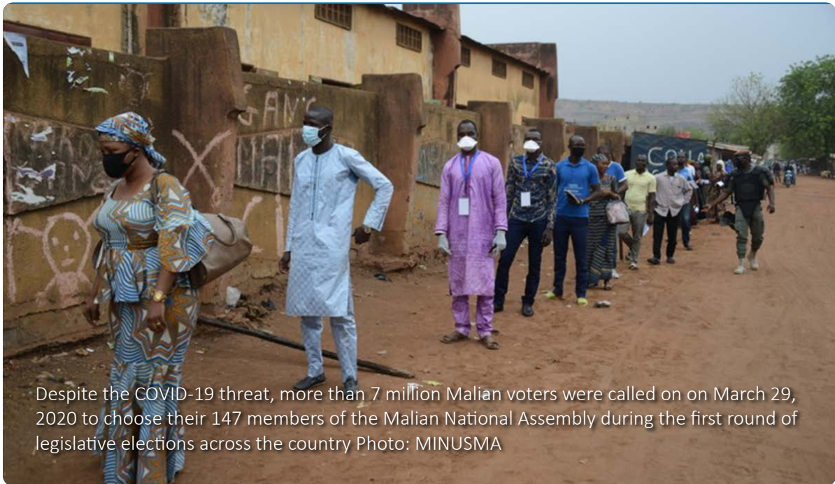
Despite the COVID-19 threat, more than 7 million Malian voters were called on on March 29, 2020 to choose their 147 members of the Malian National Assembly during the first round of legislative elections across the country