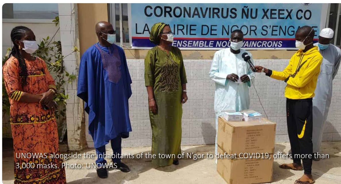
UNOWAS alongside the inhabitants of the town of N'gor to defeat COVID19, offers more than 3,000 masks.

related, inter alia, to the organization of peaceful elections, the respect of human rights, and the role of women and youth in the consolidation of Peace and Security in West Africa and the Sahel..