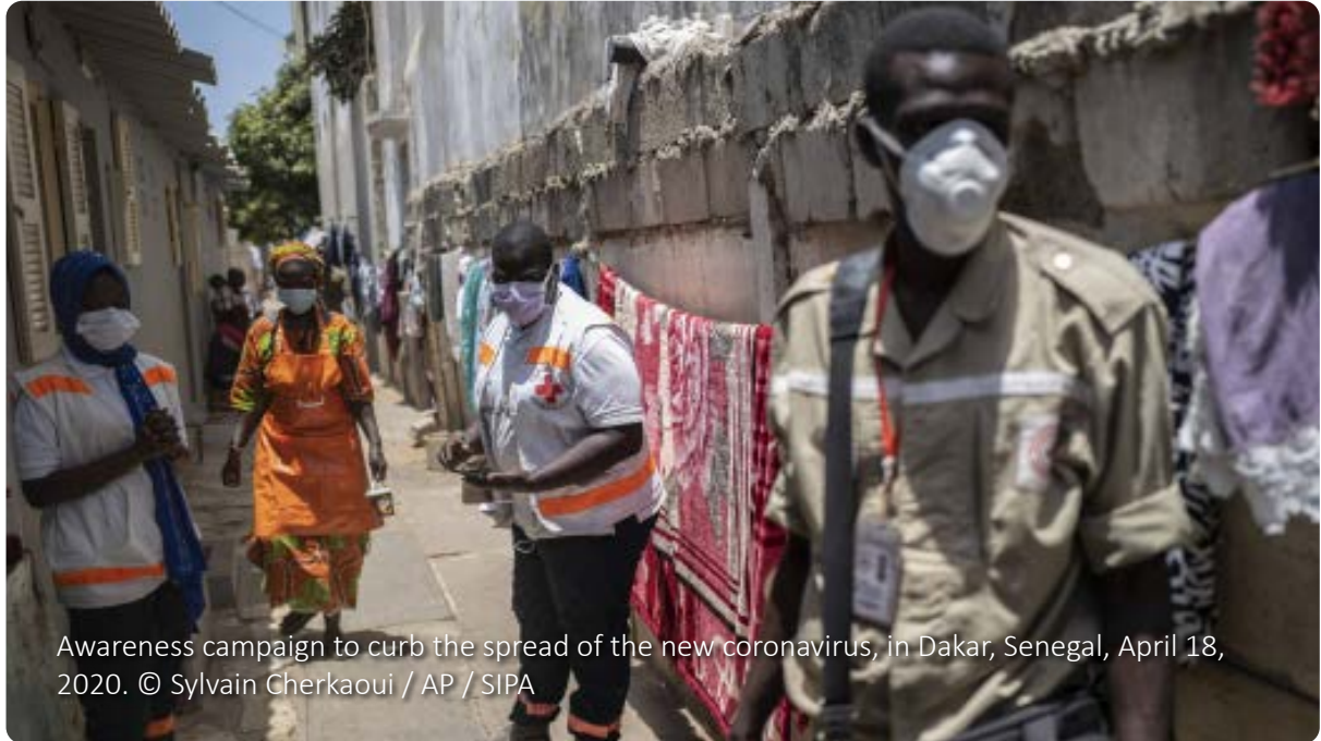
Awareness campaign to curb the spread of the new coronavirus, in Dakar, Senegal, April 18, 2020.