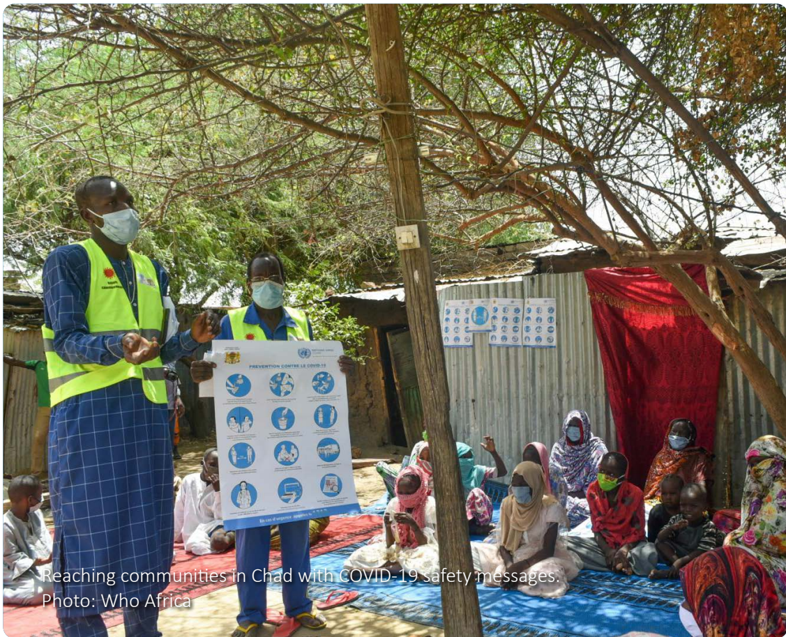
Reaching communities in Chad with COVID-19 safety messages.