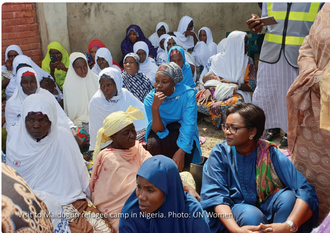
Visit to Maiduguri refugee camp in Nigeria.

total confinement can prevent them from earning a living and meeting the basic needs of their families. Experiences have shown that where women are primarily responsible for providing and preparing food for the family, increased food insecurity in the wake of crises can expose them to precariousness and family destabilization and to an increased risk of domestic violence due to heightened tensions within the household. For some of them, especially those who run small businesses whether in the formal or informal, the lack of support measures they face lead them to choose between opening their business or staying at home to take care of their family.