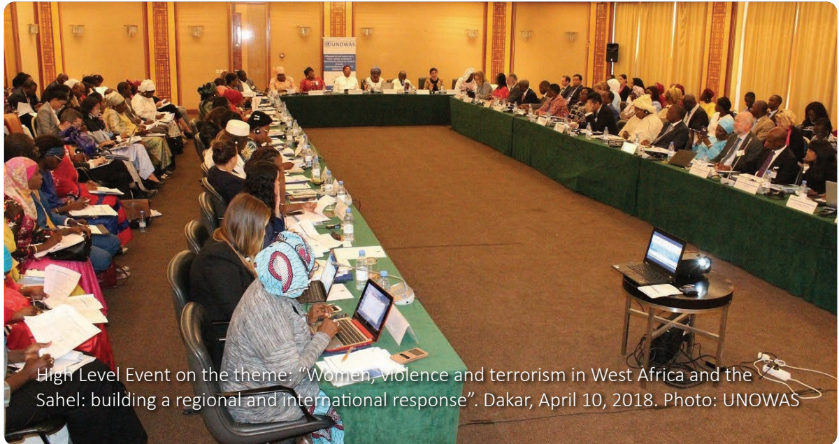
High Level Event on the theme: "Women, violence and terrorism in West Africa and the Sahel: building a regional and international response". Dakar, April 10, 2018.