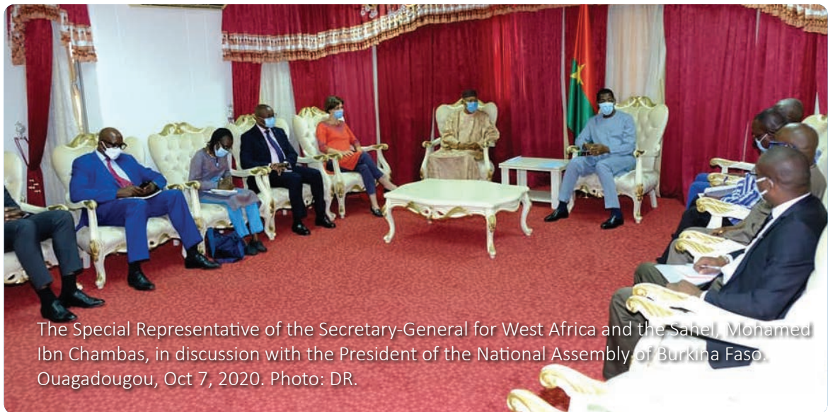
The Special Representative of the Secretary-General for West Africa and the Sahel, Mohamed Ibn Chambas, in discussion with the President of the National Assembly of Burkina Faso, Ouagadougou, Oct 7, 2020.

The objective was to take stock of the preparations for the upcoming elections to be held against the backdrop of COVID-19, and to mobilize all stakeholders to work together to ensure the organization of peaceful elections.