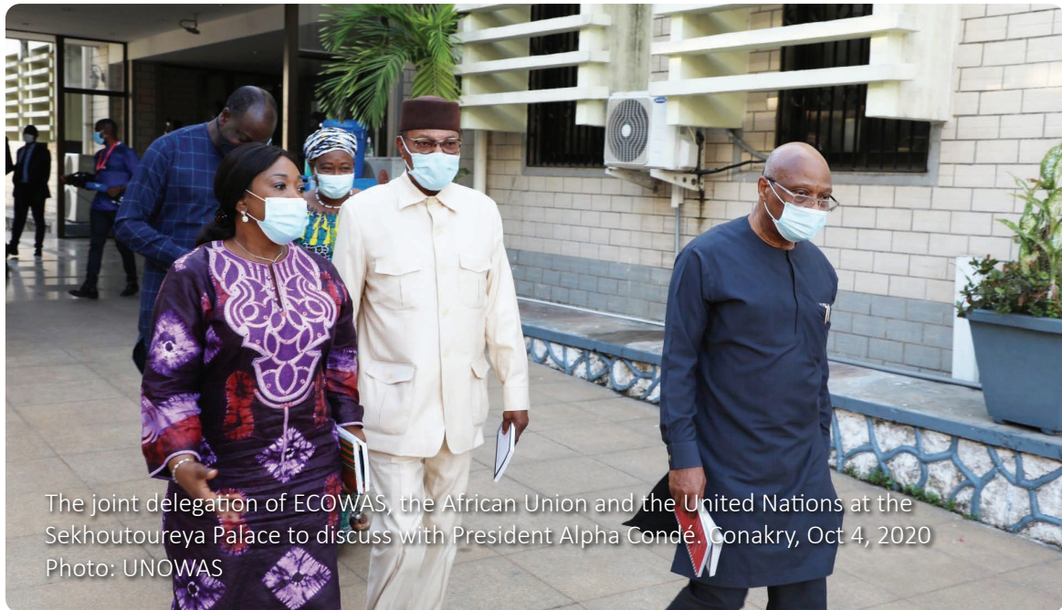
The joint delegation of ECOWAS, the African Union and the United Nations at the Sekhoutoureira Palace to discuss with President Alpha Condé. Conakry, Oct 4, 2020

Five countries will hold elections: Guinea, Cote d'Ivoire, Burkina Faso, Ghana and Niger. Despite the COVID-19 pandemic, UNOWAS, in close coordination with its regional partners, ECOWAS and the AU, have been mobilized through joint missions to prevent potential crises and conflicts.