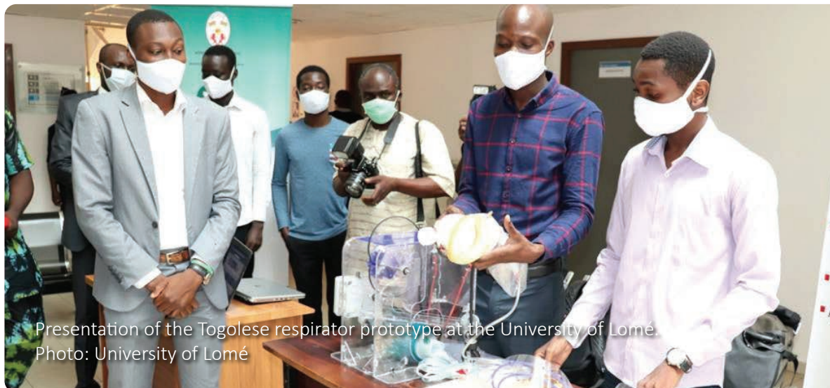
Presentation of the Togolese respirator prototype at the University of Lomé.

death), the fact remains that they are under strong pressure from the impact of the pandemic: loss of jobs with the closure of businesses, especially those in the informal sector, decline or total loss of income. Growing unemployment and heightened poverty are put together with the high cost of living. Idleness, stress and depression take place in the lives of many young people and lead to the exacerbation of violence which threatens social cohesion within communities.