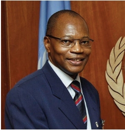
Mohamed Ibn Chambas

Special Representative of the Secretary-General and Head of United Nations Office for West Africa and the Sahel (UNOWAS)