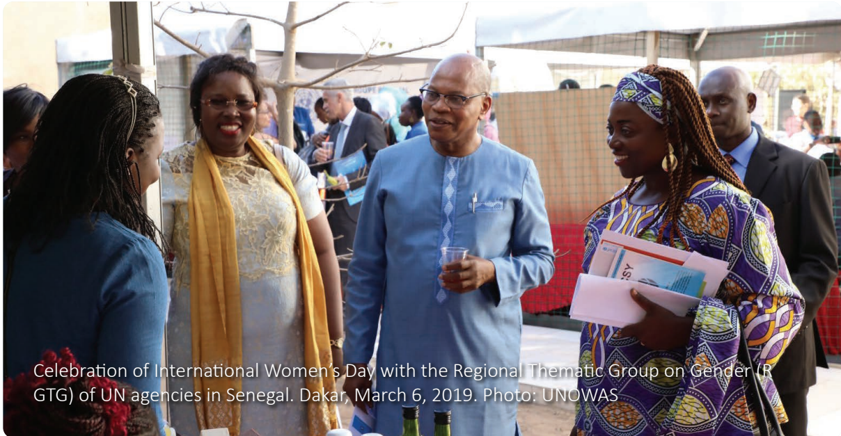
Celebration of International Women's Day with the Regional Thematic Group on Gender (RTG) of UN agencies in Senegal. Dakar, March 6, 2019.

According to statistics, women make up a little more than half of the world's total population and nearly 60% of the active population. In addition, more than a third of them are heads of households, but paradoxically, they are the ones who benefit least from the economic benefits and many of them live below the poverty line in the developing world.