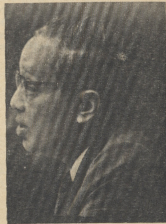
U THANT: 'Concern for Viet-Nam war victims'.

In reply, a United States Mission spokesman said that Hanoi's aggression was the only reason for the US air strikes against military targets in North Viet-Nam. He expressed regret that the Soviet Union was unwilling to advise its friends in Hanoi to seek a halt to the fighting,