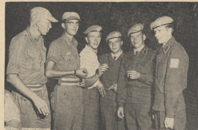
Tallaiselta näyttivät terhakkaat pioneeri-poikamme, kun he saivat kuulla Tahko Pihkalan saapumisesta.