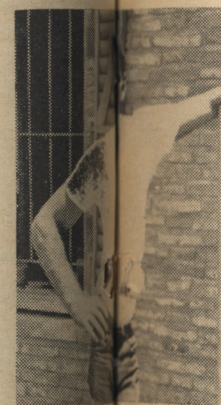
Corporal, the NCO in charge of 'Green Line Club'.

IT is possible for a UN soldier to arrive in Cyprus and say "Well I'm only here for six months, I might as well just tag along", and it is possible for him to say "What can I do to better my living area, my home for six months?" The latter is the attitude that prevails at B Squadron, 8th Canadian Hussars, and it is really paying off.