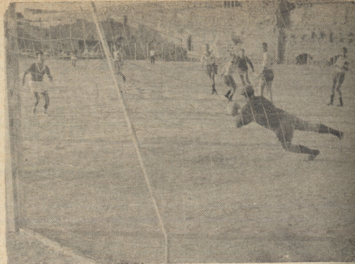
Burlejonet "Arvid" i typisk position. Det är vi serg. Petersen-en av de bättre utespelarna-som skickat iväg en rökare.