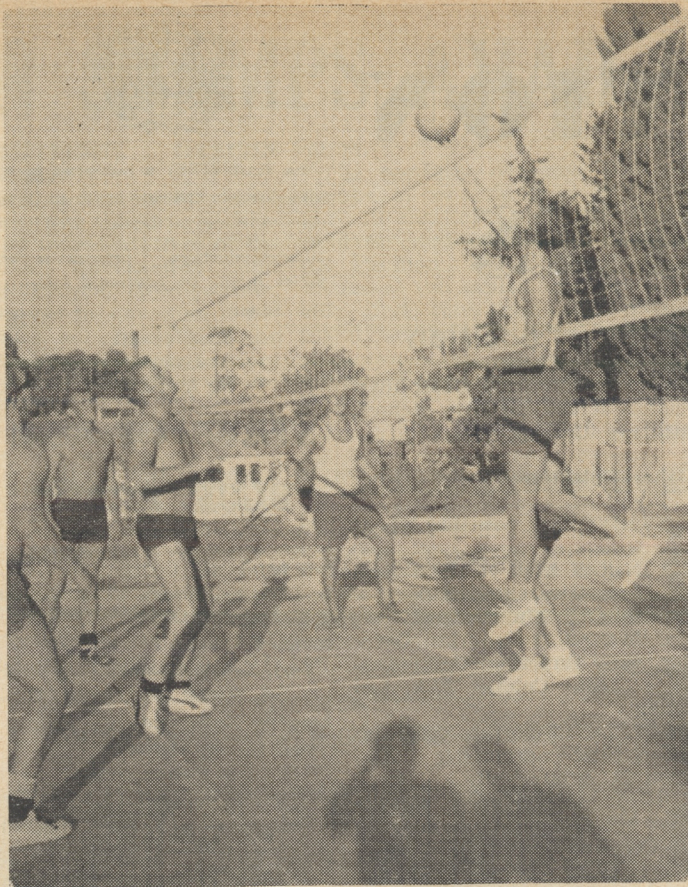
Hög satsning vid nätet. De svenske vann volley-bollmatchen mot danskarna med 3-2.