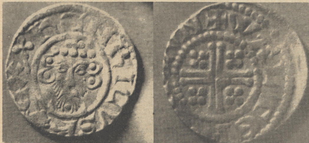
Forsidens tekst lyder: HENRICUS REX (Henrik Konge), og paa bagsiden staar der: WALTER (ON LVN?) (WALTER (fra London?)). Walter er møntmesteren, desværre er møntstedet meget utydeligt. Møntens diameter er 18 mm.