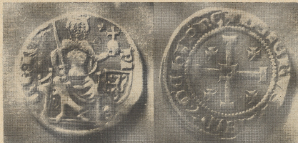
Forsidens tekst lyder: PIERE REX (Peter Konge), og paa bagsiden staar der: DE IERUSALEM & D'CHIPRE (af Jerusalem og af Cypern). I vaabenskildet ved siden af tronen ses en løve, Lusignan-slægtens vaaben. Møntens diameter er 20 mm.

Kampen blev overværet af henved 300 tilskuere, nogenlunde lige- ligt fordelt mellem svenske, danske og cyprioter. Dommer og linievogtere var cyprioter.