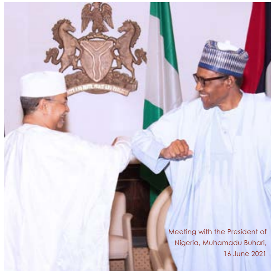
Meeting with the President of Nigeria, Muhamadu Buhari, 16 June 2021

Upon taking office, the Special Representative also met with the various United Nations country teams and Resident Coordinators, whose unwavering commitment and important work in the service of the populations and development of West Africa he praised, and the Sahel.