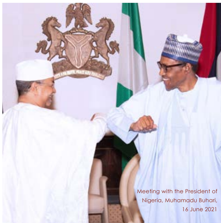
Meeting with the President of Nigeria, Muhammadu Buhari, 16 June 2021

Upon taking office, the Special Representative also met with the various United Nations country teams and Resident Coordinators, whose unwavering commitment and important work in the service of the populations and development of West Africa he praised, and the Sahel.