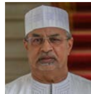
Mahamat Saleh ANNADIF Special Representative of the United Nations Secretary General for West Africa and the Sahel (UNOWAS)

“UNOWAS will continue to act in close coordination with the countries of the subregion, the United Nations system, and regional and international partners, to make West Africa and the Sahel an area of peace and development”