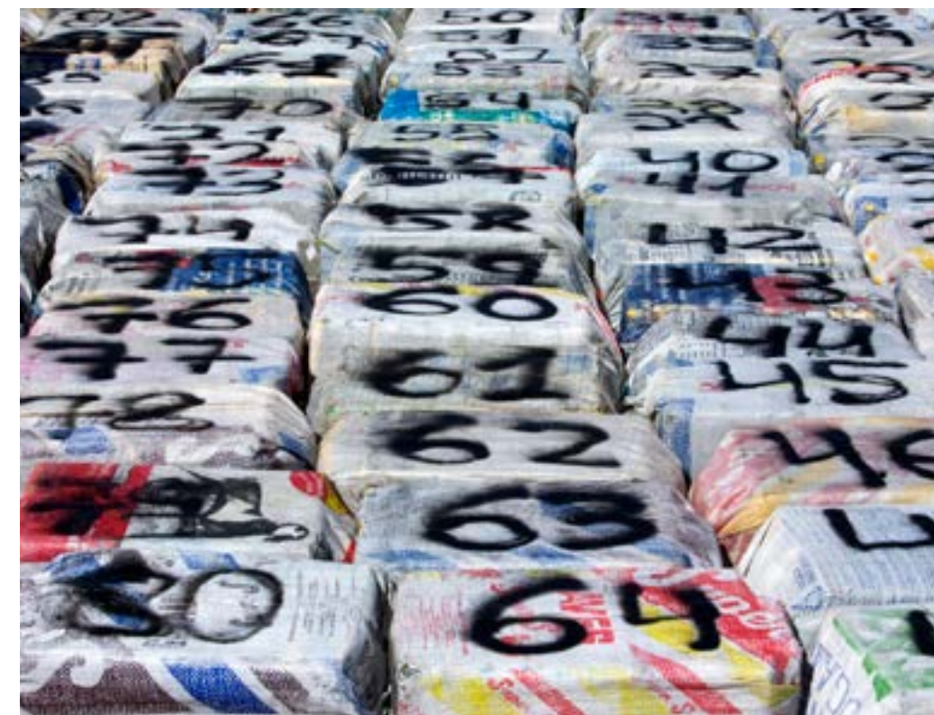
West Africa: a trafficking hub

The regional office's work also builds on UNODC's Strategic Vision for Africa 2030 seeking to strengthen crime prevention, enhance justice, address organized crime, ensure a balanced response to drugs, improve the rule of law and bolster resilience through analytic, normative and technical cooperation.